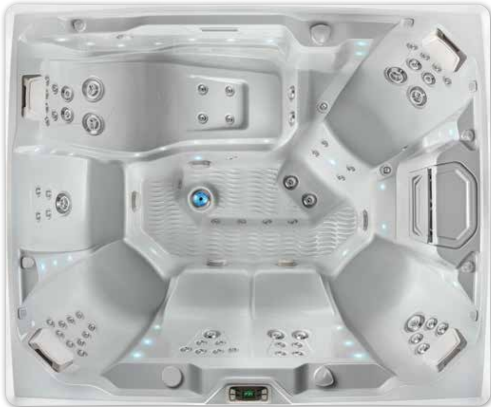
Prism shell shown in Ice Grey.

See detailed specifications for the Prism on page 32.