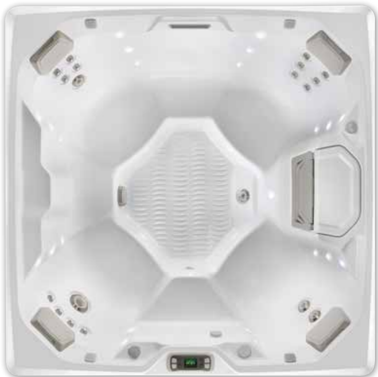
Beam shell shown in Alpine White

See detailed specifications for the Beam on page 32.