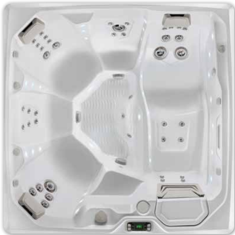
Flair shell shown in Alpine White.

See detailed specifications for the Flair on page 32.