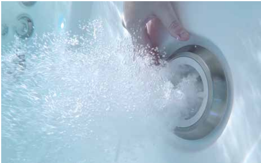
SmartJet lets you control the jet flow on and off to customise your experience.

You have different needs on different days. Only Hot Spring has the Comfort Control™ system, which allows you to dial in the ideal amount of air and