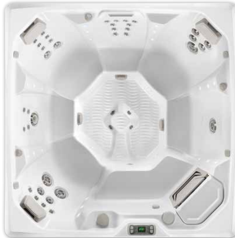
Flash shell shown in Alpine White.

See detailed specifications for the Flash on page 32.