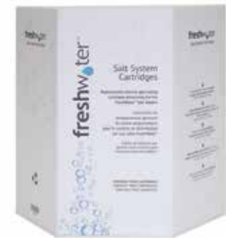
One 3-pack of cartridges provides a year's worth of water care.*