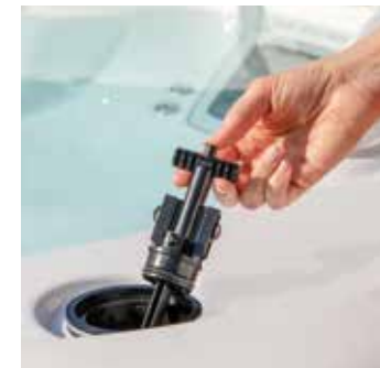
The maintenance-free cartridge can be replaced in seconds, without tools.

The FreshWater Salt System will change the way you use your hot tub by taking the worry out of water care. With water that is always hot and ready to use, you will spend less time maintaining your spa and more time using it.