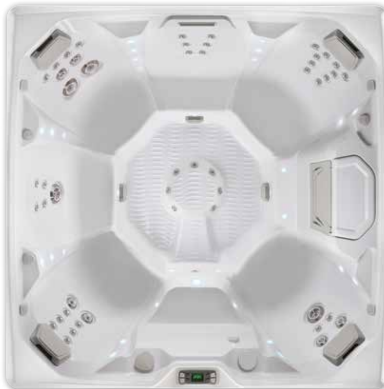
Pulse shell shown in Alpine White.

See detailed specifications for the Pulse on page 32.