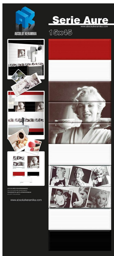
PE AURE MARYLIN 15X45 (80x180)