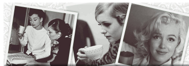
DECOR MARYLIN 02 15X45 P41