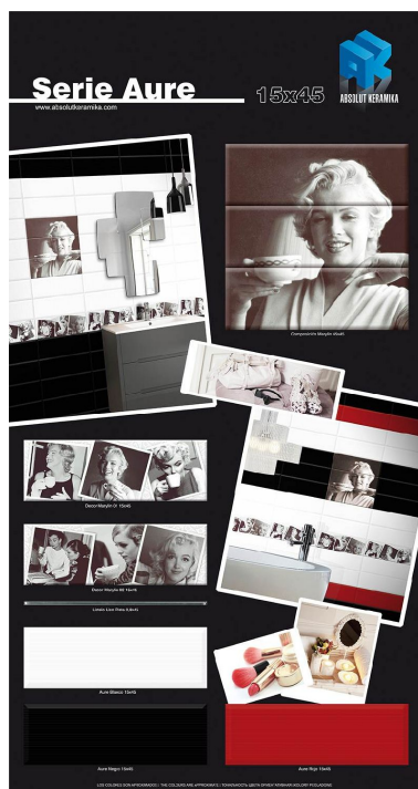
PT AURE MARYLIN 15x45 (100.5x192.5)