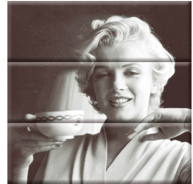
COMPOSICION MARYLIN 45X45 P133