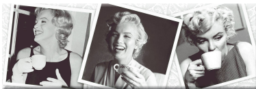
DECOR MARYLIN 01 15X45 P41