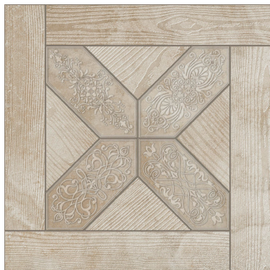
CARCASSONNE ARCE 45X45 B16