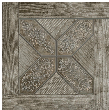
CARCASSONNE TEKA 45X45 B16