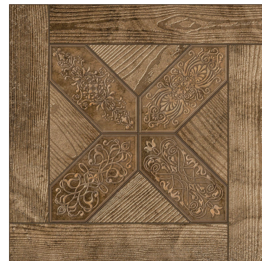
CARCASSONNE NOGAL 45X45 B16