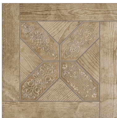
CARCASSONNE ROBLE 45X45 B16