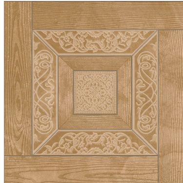
NARBONNE OCRE 45X45