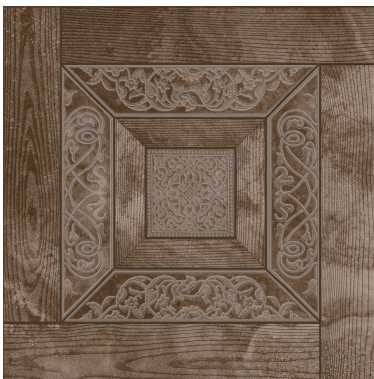
NARBONNE WENGUE 45X45