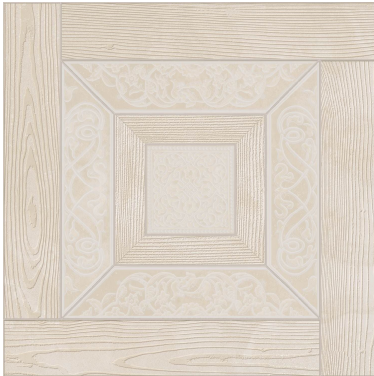
NARBONNE BEIGE 45X45