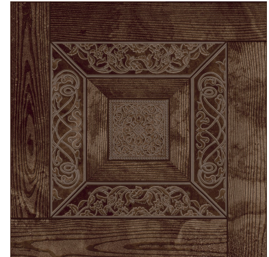
NARBONNE TIERRA 45X45