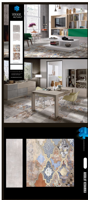
PE PASTELLATO 44.7X44.7 (80X180)