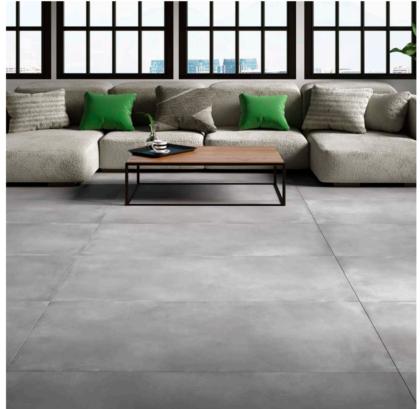
Manhattan grey 60x120 / 24"x48"