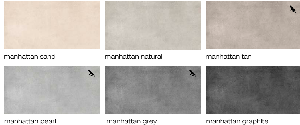
manhattan sand manhattan natural manhattan tan manhattan pearl manhattan grey manhattan graphite

Formato únicamente disponible en ADZ en los colores Pearl, Tan y Grey