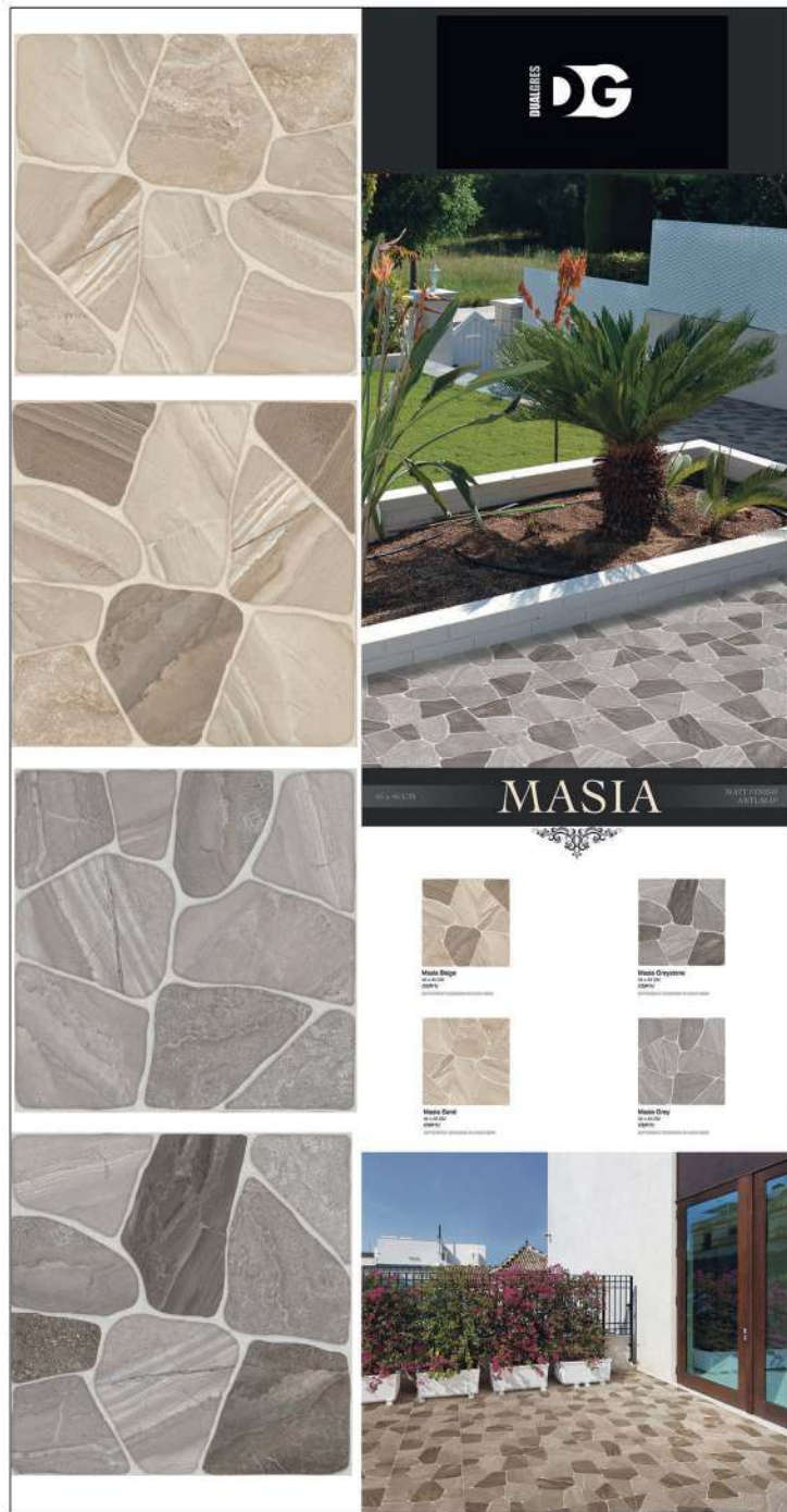
BEL17_001 · PANEL MASIA