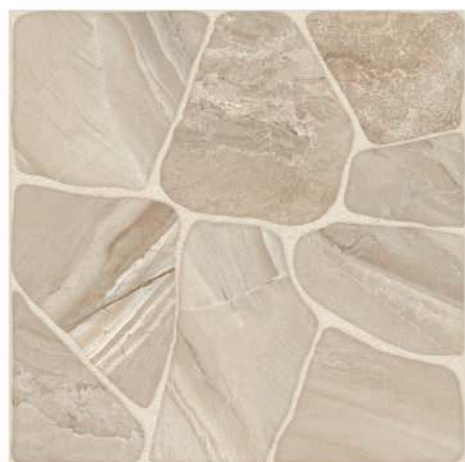
DK Masia Sand 45 x 45 CM C3 (R11)