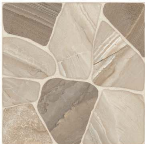
DK Masia Beige 45 x 45 CM C3 (R11)