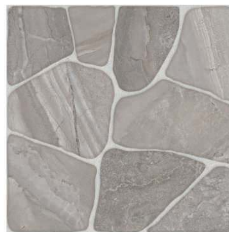
DK Masia Grey 45 x 45 CM C3 (R11)