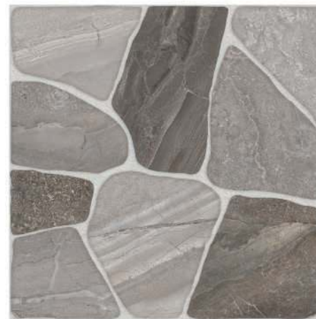
DK Masia Greystone 45 x 45 CM C3 (R11)