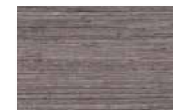
JAPAN MARINE - M 20x31,6x0,9cm P3149883 / 100160372 G205 Butech recomienda junta: Butech recommends joint: Colorstuk Rapid n Cemento B22502004 / 100004297