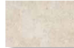
PARK ARENA 20x31,6x0,8cm P3149886 / 100157371 G205 Butech recomienda junta: Butech recommends joint: Colorstuk Rapid n Gris B22502013 / 100004305