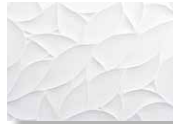
OXO DECO BLANCO 31,6x44,6x1cm P3099053 / 100115575 G226 Butech recomienda junta / Butech recommends joint: Colorstuk Rapid n Blanco B22501001 / 100004294