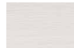
JAPAN BLANCO - M 20x31,6x0,9cm P3149882 / 100160371 G205 Butech recomienda junta: Butech recommends joint: Colorstuk Rapid n Gris B22502013 / 100004305 Colorstuk Rapid n Blanco B22501001 / 100004294