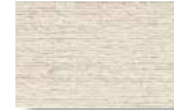
PARK LINEAL ARENA 20x31,6x1cm P3149884 / 100157377 G222 Butech recomienda junta: Butech recommends joint: Colorstuk Rapid n Gris B22502013 / 100004305