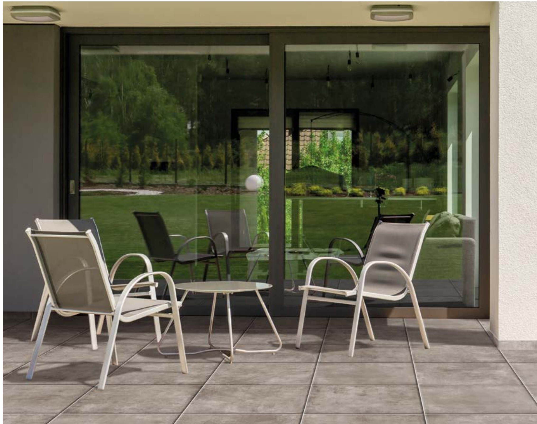
Neo Ceniza Antislip 60x60