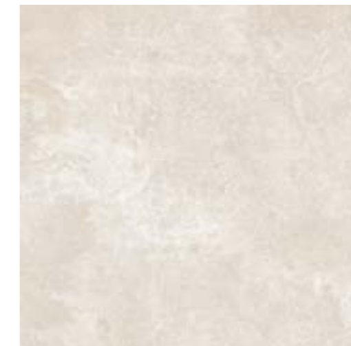
NEO IVORY 60x60