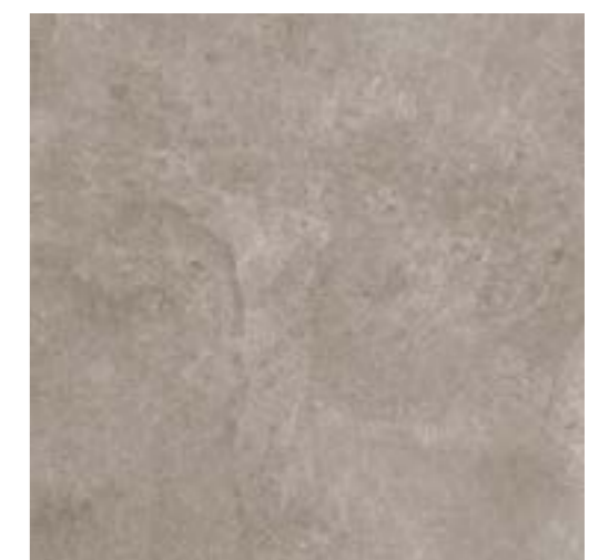
NEO CENIZA 60x60