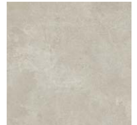
NEO TAUPE 60x60