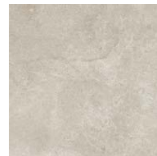
NEO GRIS 60x60