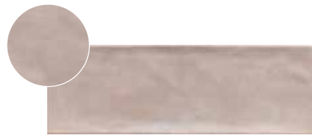
NEW AGE TOPO PR-16