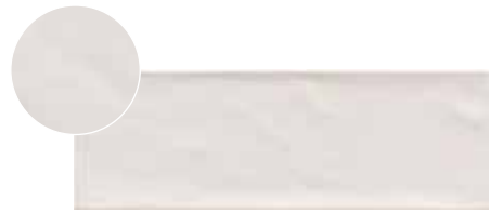
NEW AGE LIGHT PR-16