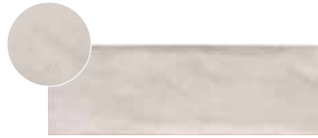
NEW AGE PEARL PR-16