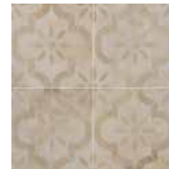
NEW AGE DEC. 2 TAN PR-7