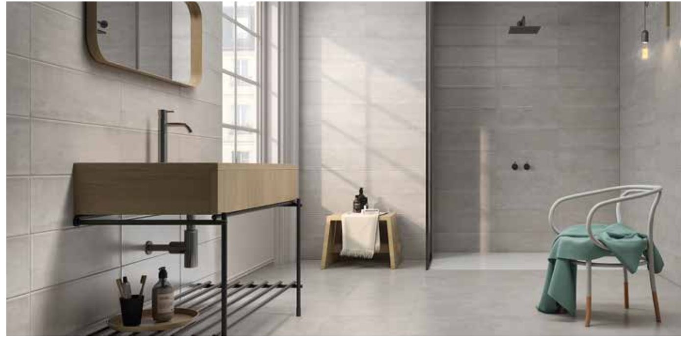
RVTO: NEW AGE PEARL 20x60. PVTO: NEW AGE PEARL 45x45