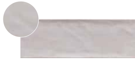
NEW AGE CLOUD PR-16