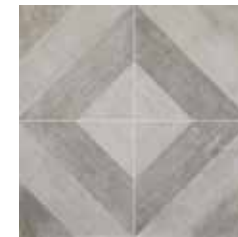
NEW AGE DEC. 3 PEARL PR-7

PAVIMENTO COORDINADO COLECCIONES NEW AGE Y BASIC. / MATCHING FLOOR TILES NEW AGE AND BASIC.