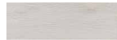
BASIC LIGHT PR-17