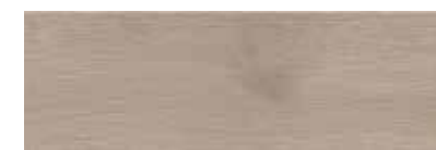
BASIC NUEZ PR-17