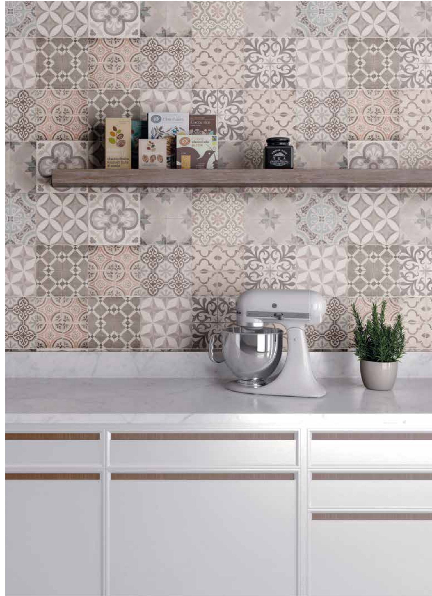
RVTO: NEW TIME DEC.-1 LIGHT 20x60