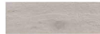
BASIC PEARL PR-17