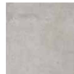
NEW AGE PEARL PR-7