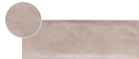
NEW TIME TOPO PR-16