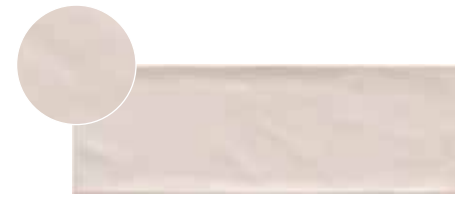
NEW TIME TAN PR-16