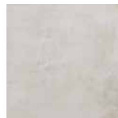
NEW AGE LIGHT PR-7