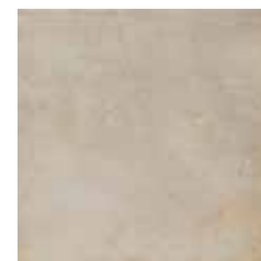
NEW AGE TAN PR-7