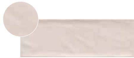
NEW AGE TAN PR-16