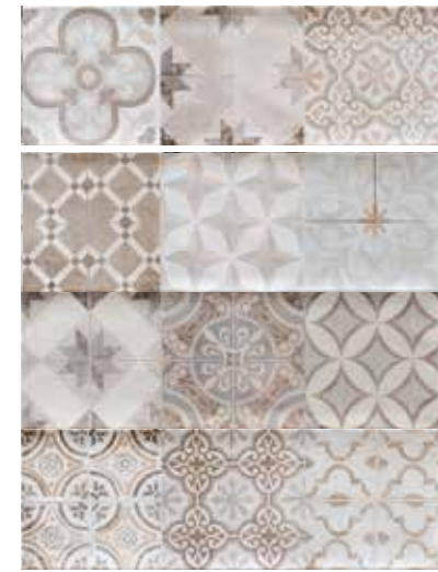
NEW TIME DEC.-1 LIGHT PR-19 Variación gráfica / Variation in pattern