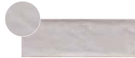
NEW TIME CLOUD PR-16