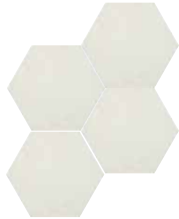
OHIO IVORY 23X26 / 9"X10" D04/M