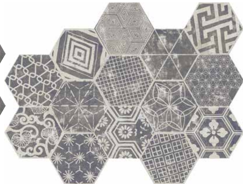
IOWA GREY MIX 23X26 / 9"X10" T40/M