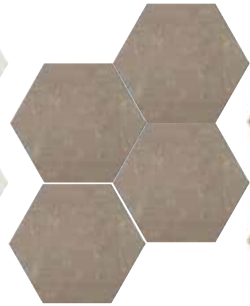
OHIO TORTOLA 23X26 / 9"X10" D04/M