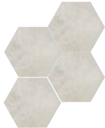
OHIO GREY 23X26 / 9"X10" D04/M