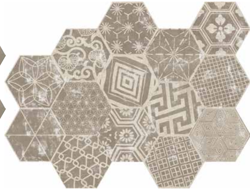
IOWA IVORY MIX 23X26 / 9"X10" T40/M