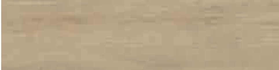
Otawa Cedro 39,5 x 160 cm.