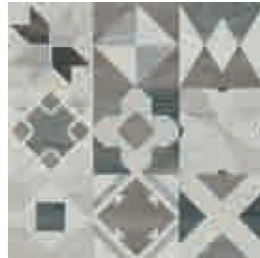
Phuket Mix Silver 60 x 60 cm.