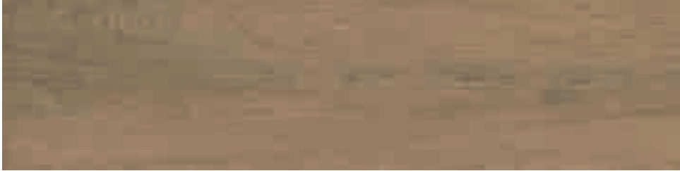
Otawa Nogal 39,5 x 160 cm.