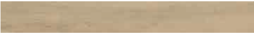
Otawa Cedro 20 x 160 cm.