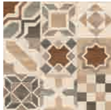
Phuket Mix Ivory 60 x 60 cm.