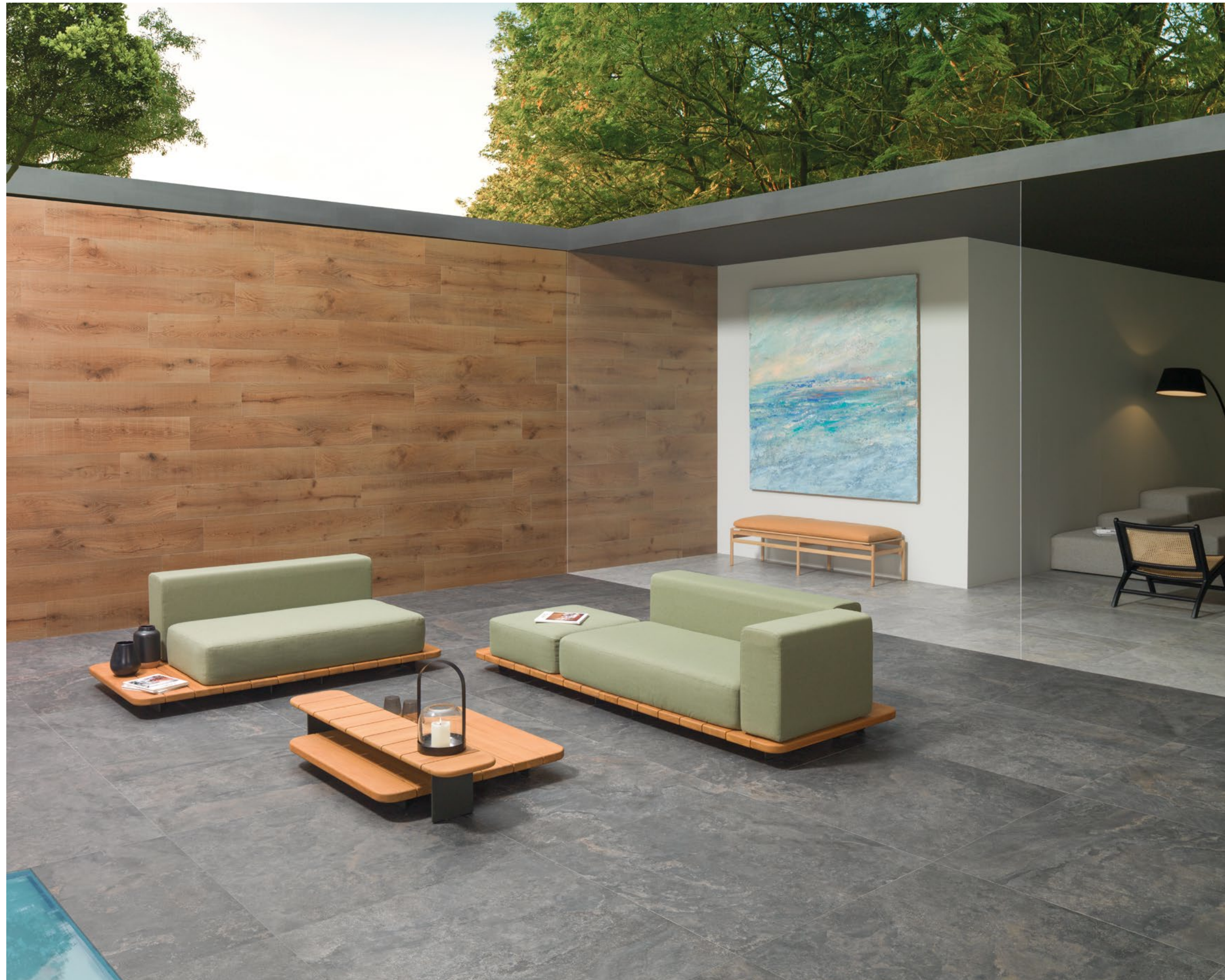
Pensa Silver 100 cm x 100 cm Pensa Dark 100 cm x 100 cm