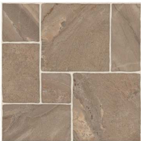
DK Petra Pulpis 45 x 45 CM C3(R11)