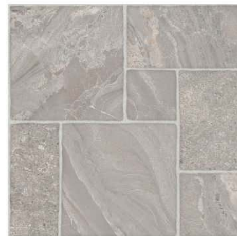
DK Petra Silver 45 x 45 CM C3(R11)