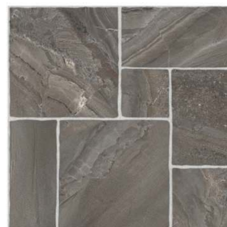
DK Petra Graphite 45 x 45 CM C3(R11)