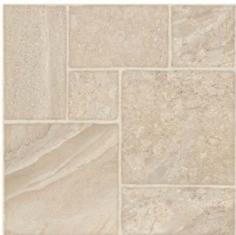
DK Petra Sand 45 x 45 CM C3(R11)