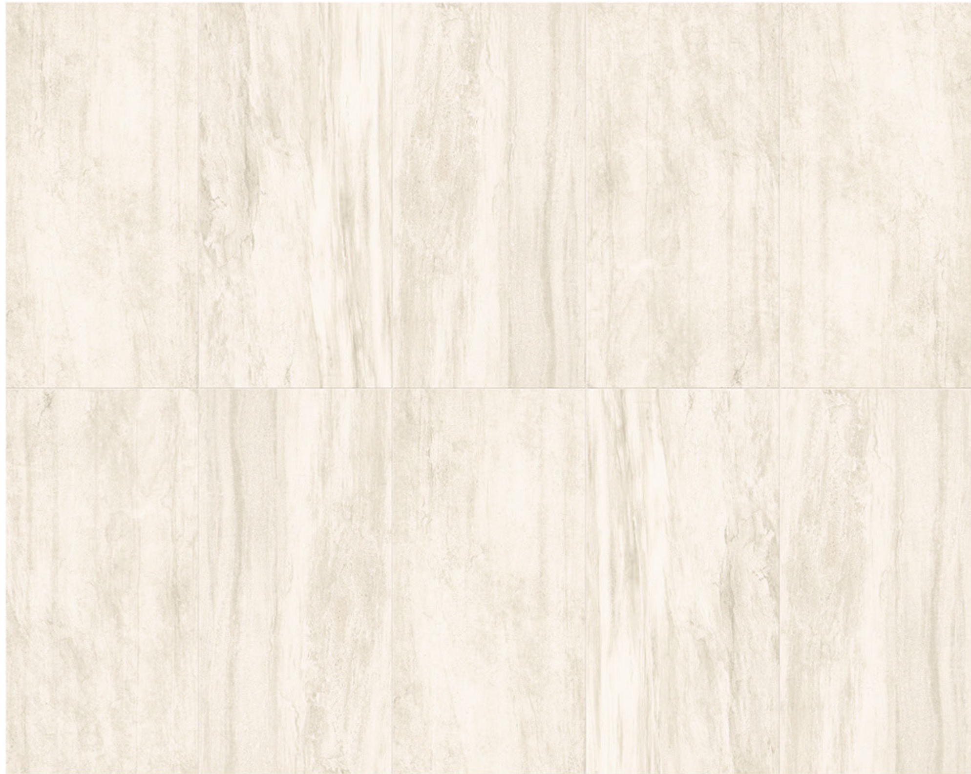
REMIX Folk 60x120cm | GRM01