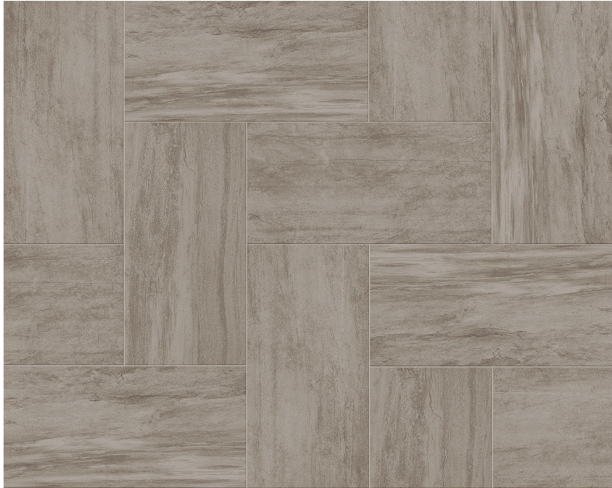
REMIX Jazz 60x120cm | GRM02