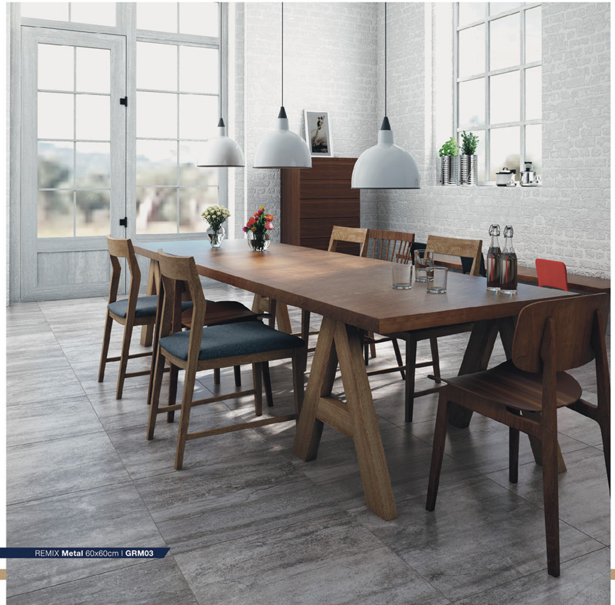
REMIX Metal 60x60cm | GRM03