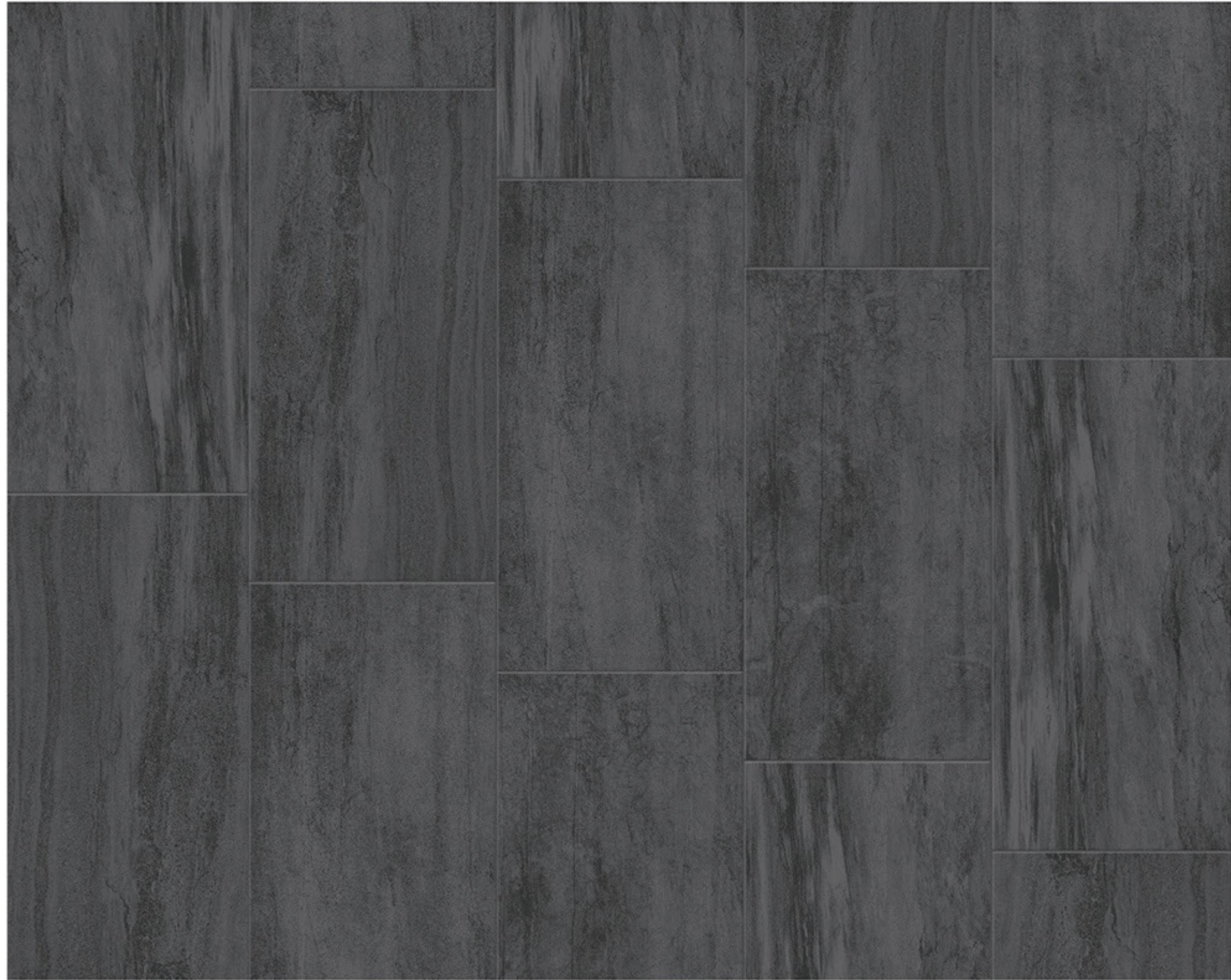
REMIX Pop Rock 60x120cm | GRM04