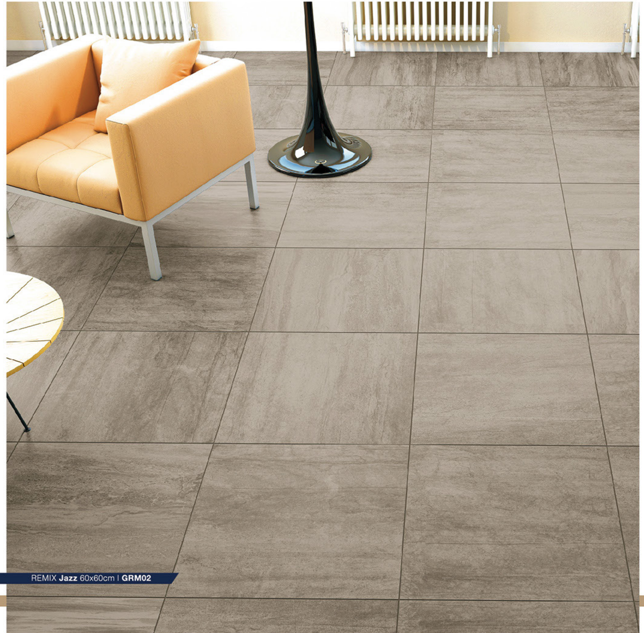
REMIX Jazz 60x60cm | GRM02