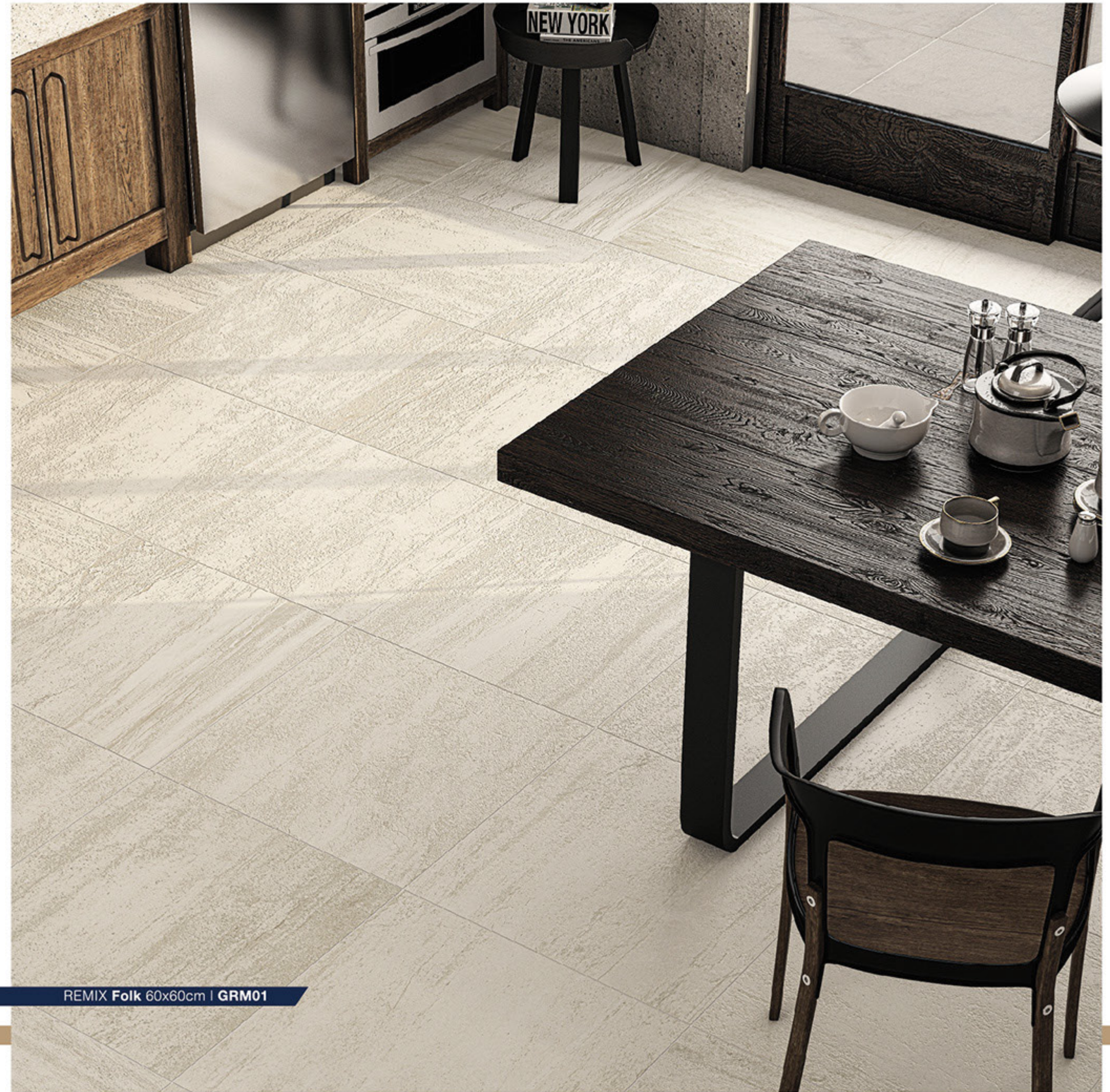
REMIX Folk 60x60cm | GRM01