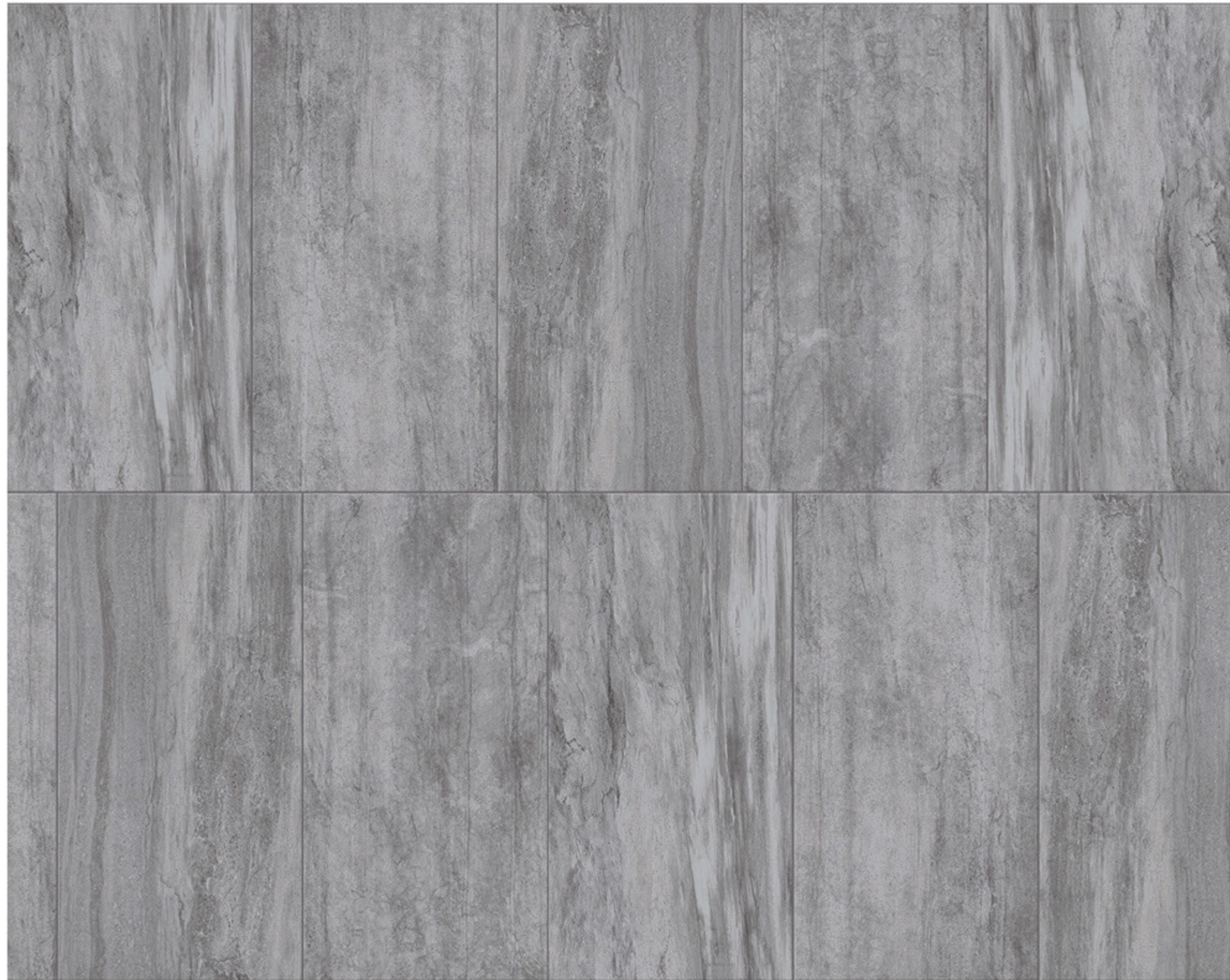
REMIX Metal 60x120cm | GRM03