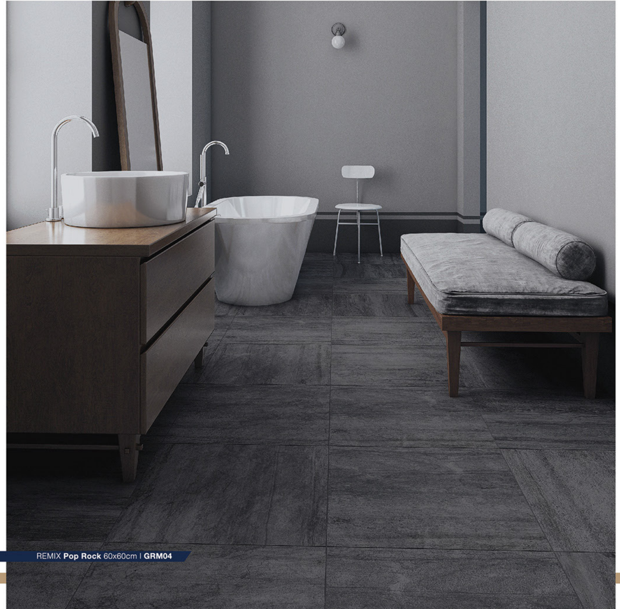
REMIX Pop Rock 60x60cm | GRM04