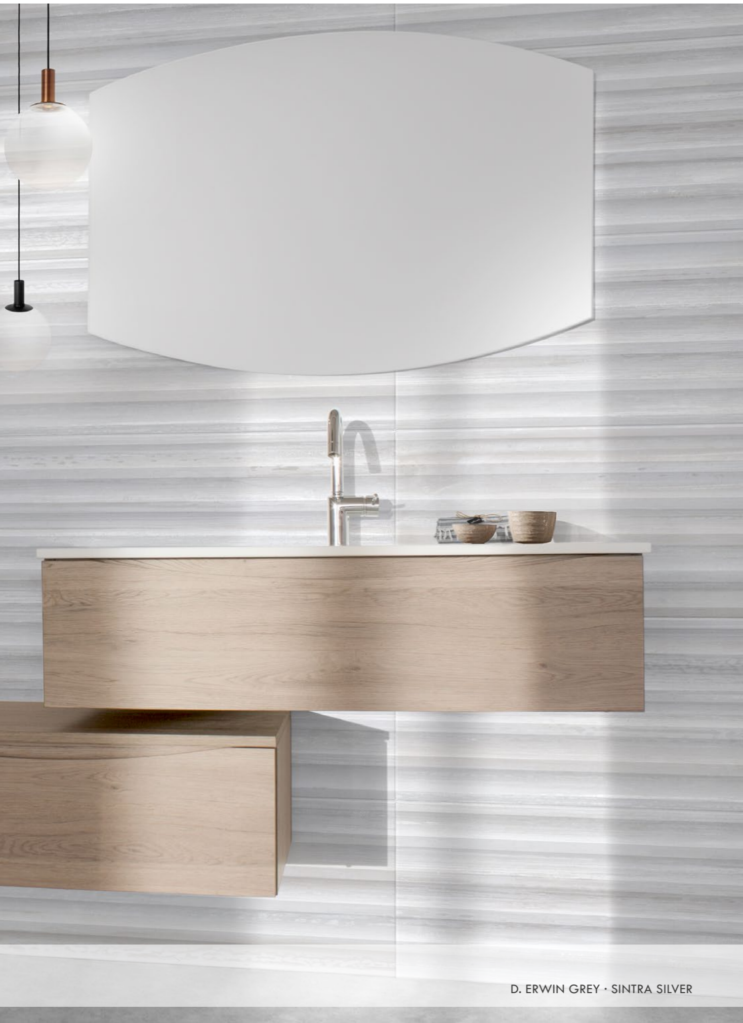
D. ERWIN GREY · SINTRA SILVER