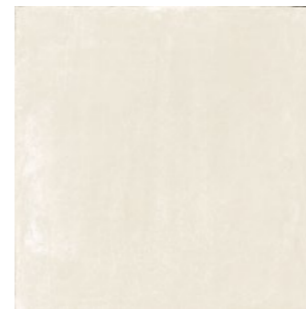
SINTRA SAND 59x59 24"x24" RECTIFIED NATURAL G536 R10/C2 PEI IV

PAVIMENTO SUGERIDO · SUGGESTED FLOOR TILE