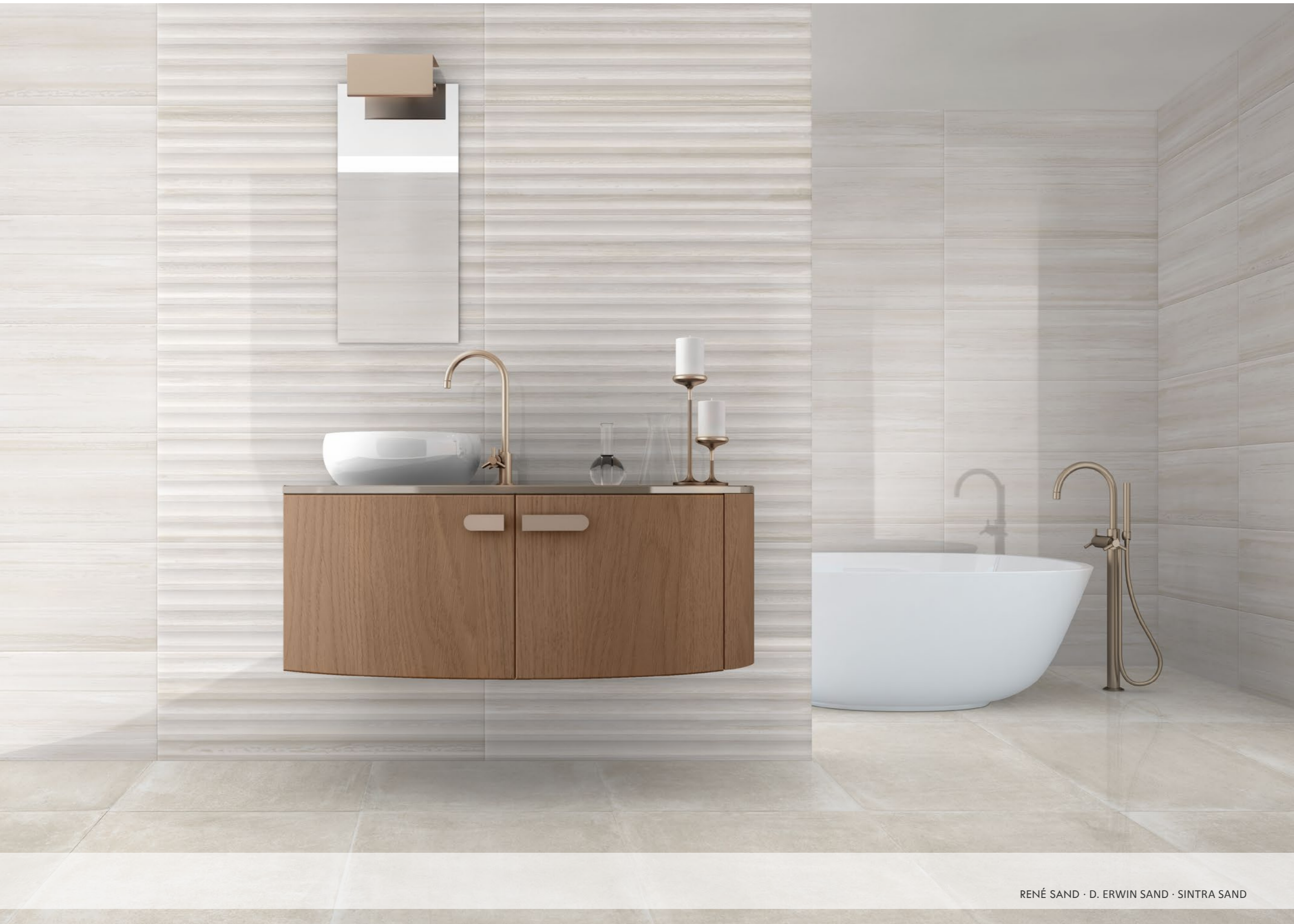
RENÉ SAND · D. ERWIN SAND · SINTRA SAND