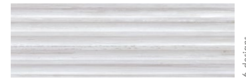
RENÉ GREY 30x90 12"x36" RECTIFIED NATURAL G545