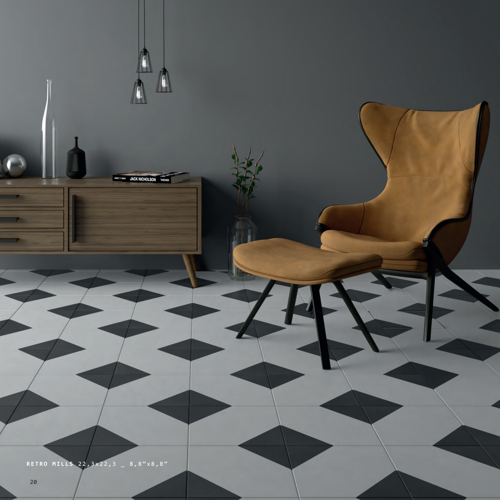
RETRO MILLS 22,3x22,3 _ 8,8"x8,8"