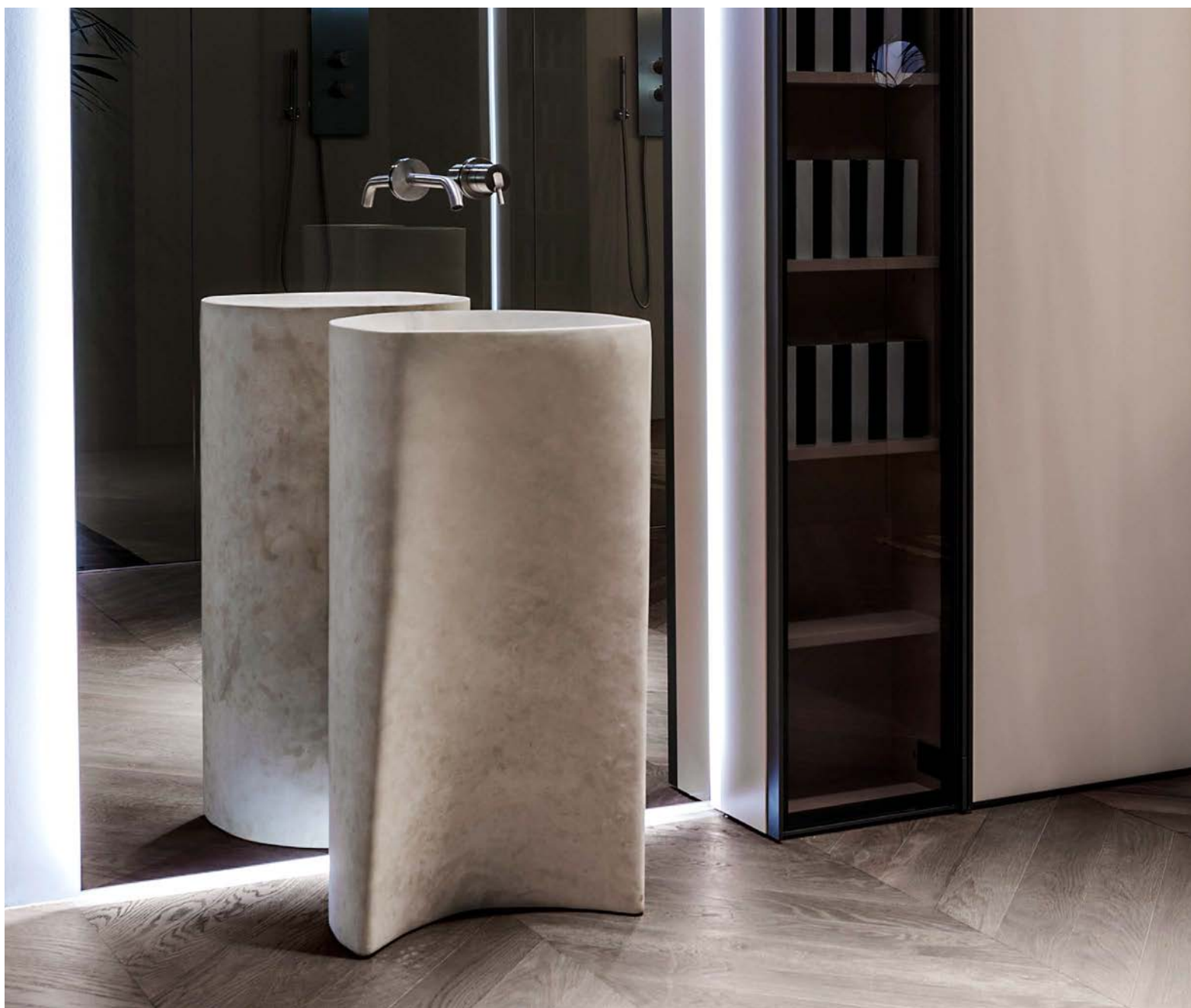
LAVABI FREESTANDING FREESTANDING SINKS