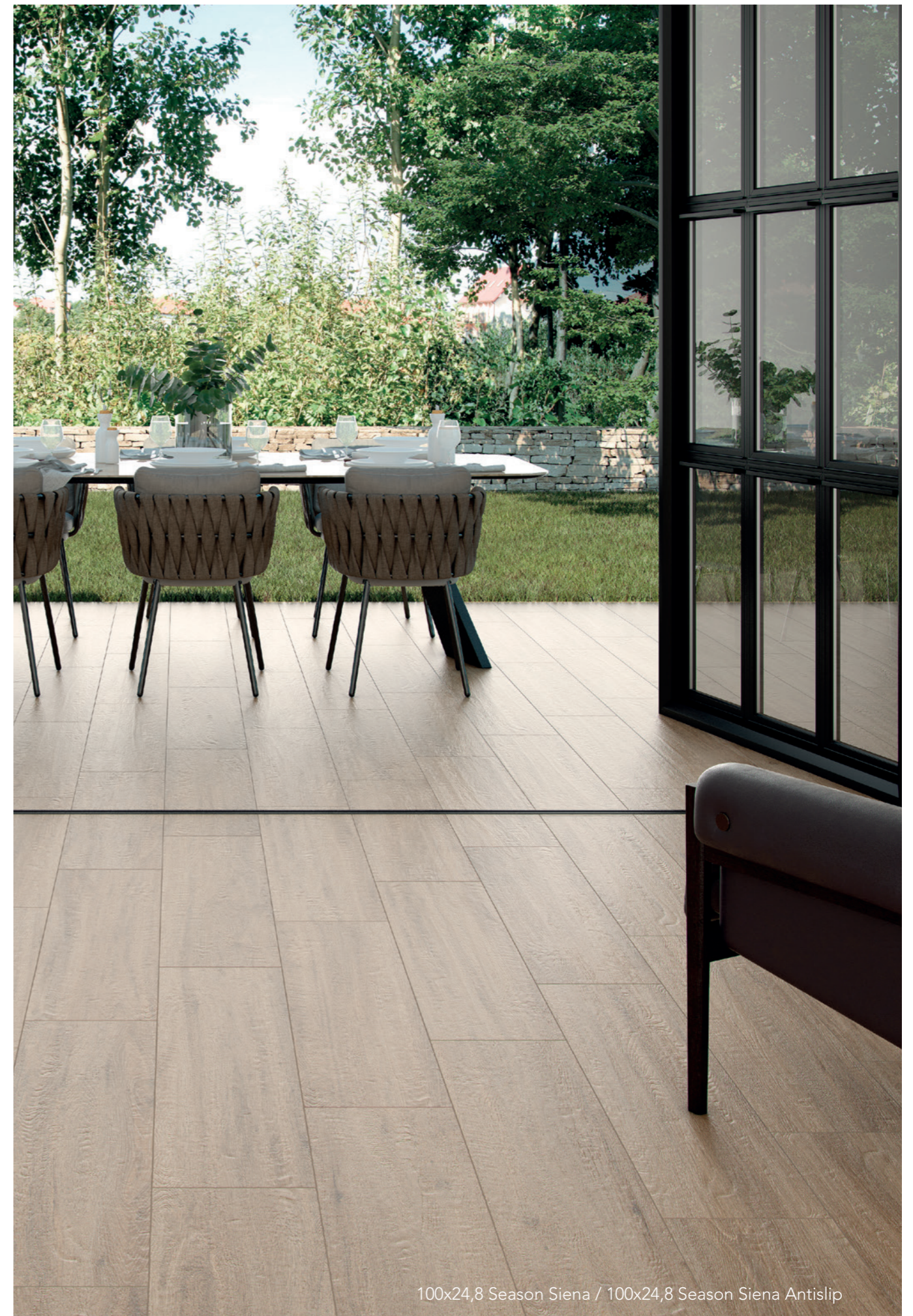
100x24,8 Season Siena / 100x24,8 Season Siena Antislip