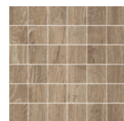
BLOCK SEASON SIENA P0000190 30x30_12"x12