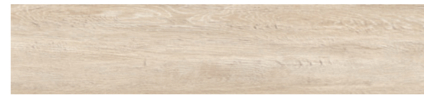
GZV44001 / SEASON CREMA UPEC U4 P3 E3 C2