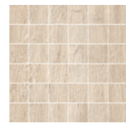
BLOCK SEASON CREMA P0000188 30x30_12"x12