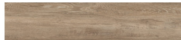
GZV44021 / SEASON ROBLE ANTISLIP Clase 3 / R11 / A+B+C