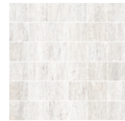
BLOCK SEASON BLANCO P0000187 30x30_12"x12