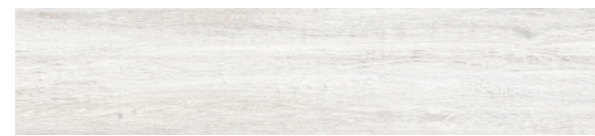
GZV44000 / SEASON BLANCO UPEC U4 P3 E3 C2