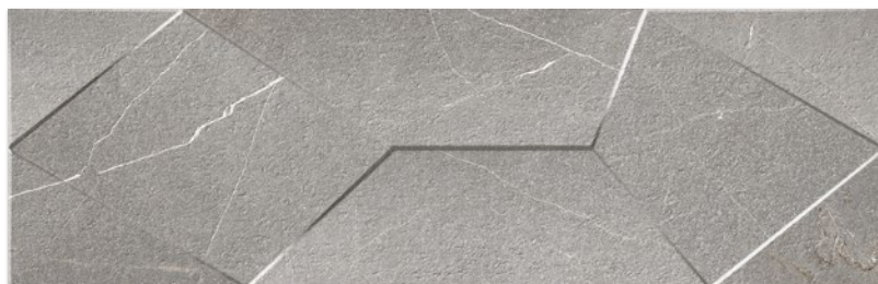
SENSES GREY DECO (Relieve|Structured)