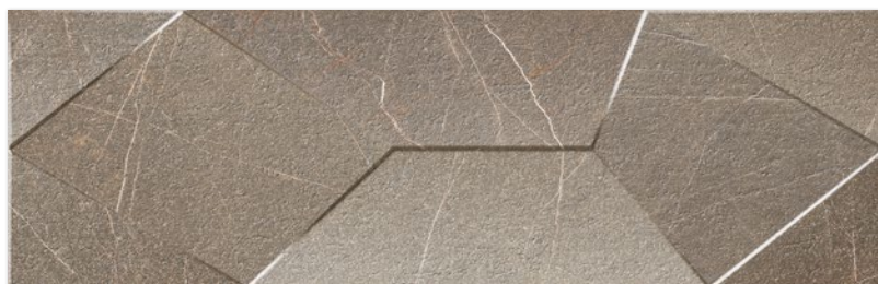
SENSES BROWN DECO (Relieve|Structured)