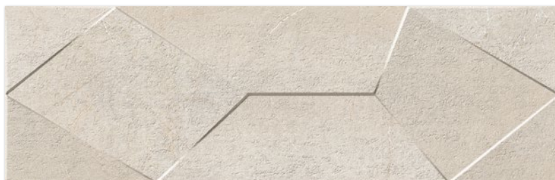
SENSES BEIGE DECO (Relieve|Structured)