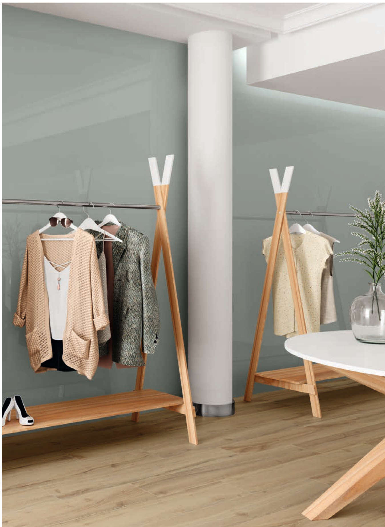
Silver Pulido 260 x 120 cm. Pavimento Liverpool Teak 20 x 120 cm.