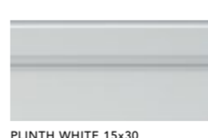
PLINTH WHITE 15x30