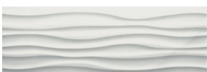
WAVE GLASS GLOSSY