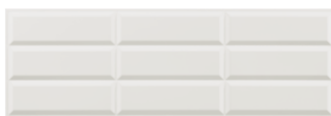
CUBIC ANTÁRTIDA MATT