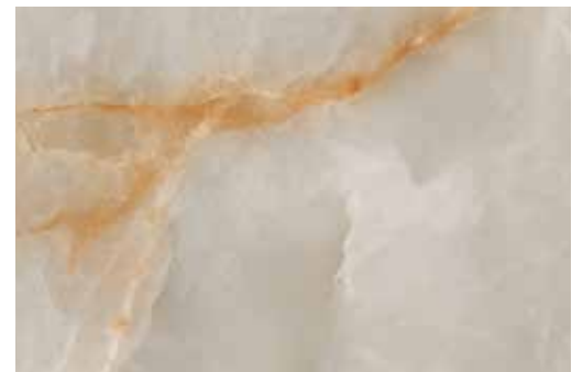
the collection Agatha Bianco