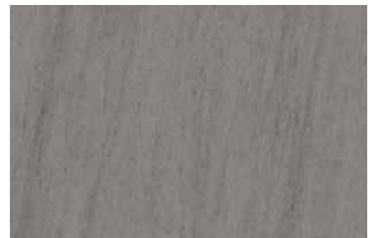
the collection Basalto Oscuro