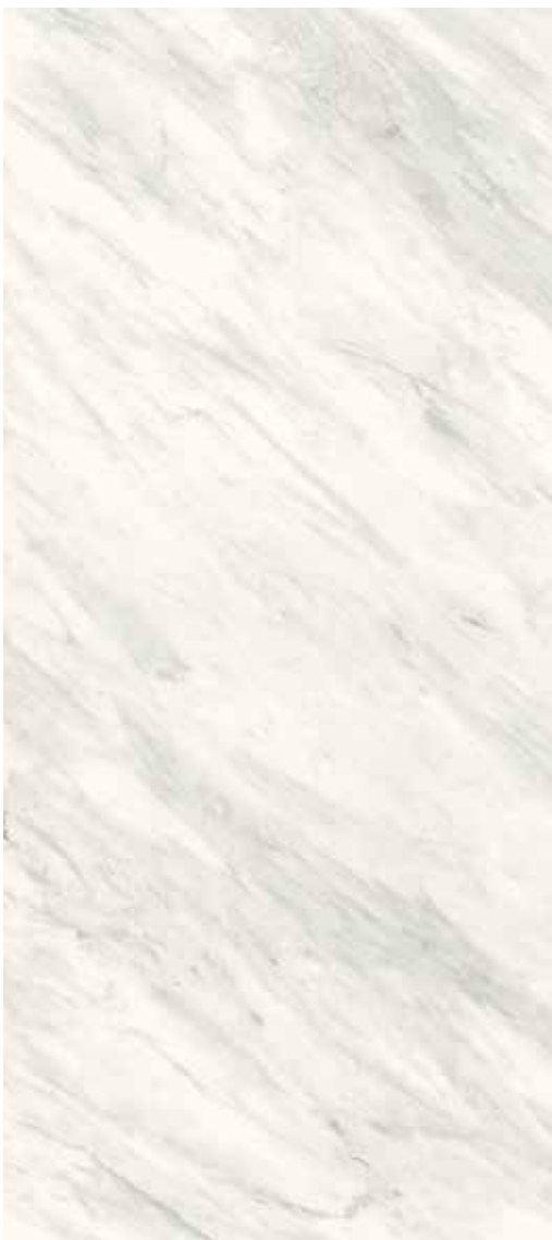
the collection Milos Bianco