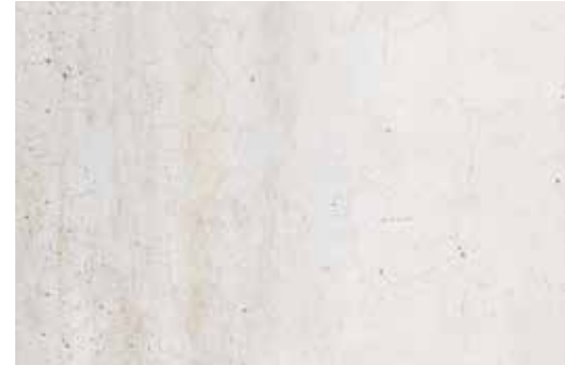
the collection Strattos