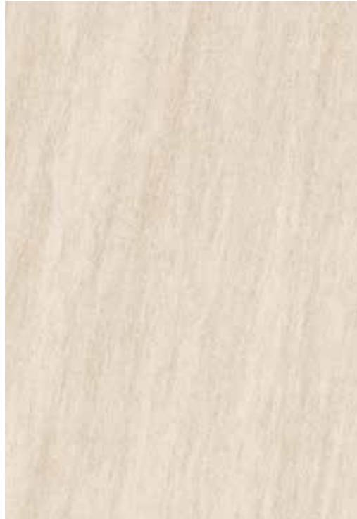
the collection Basalto Beige