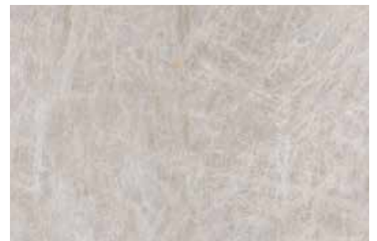
the collection Quartzite Stone