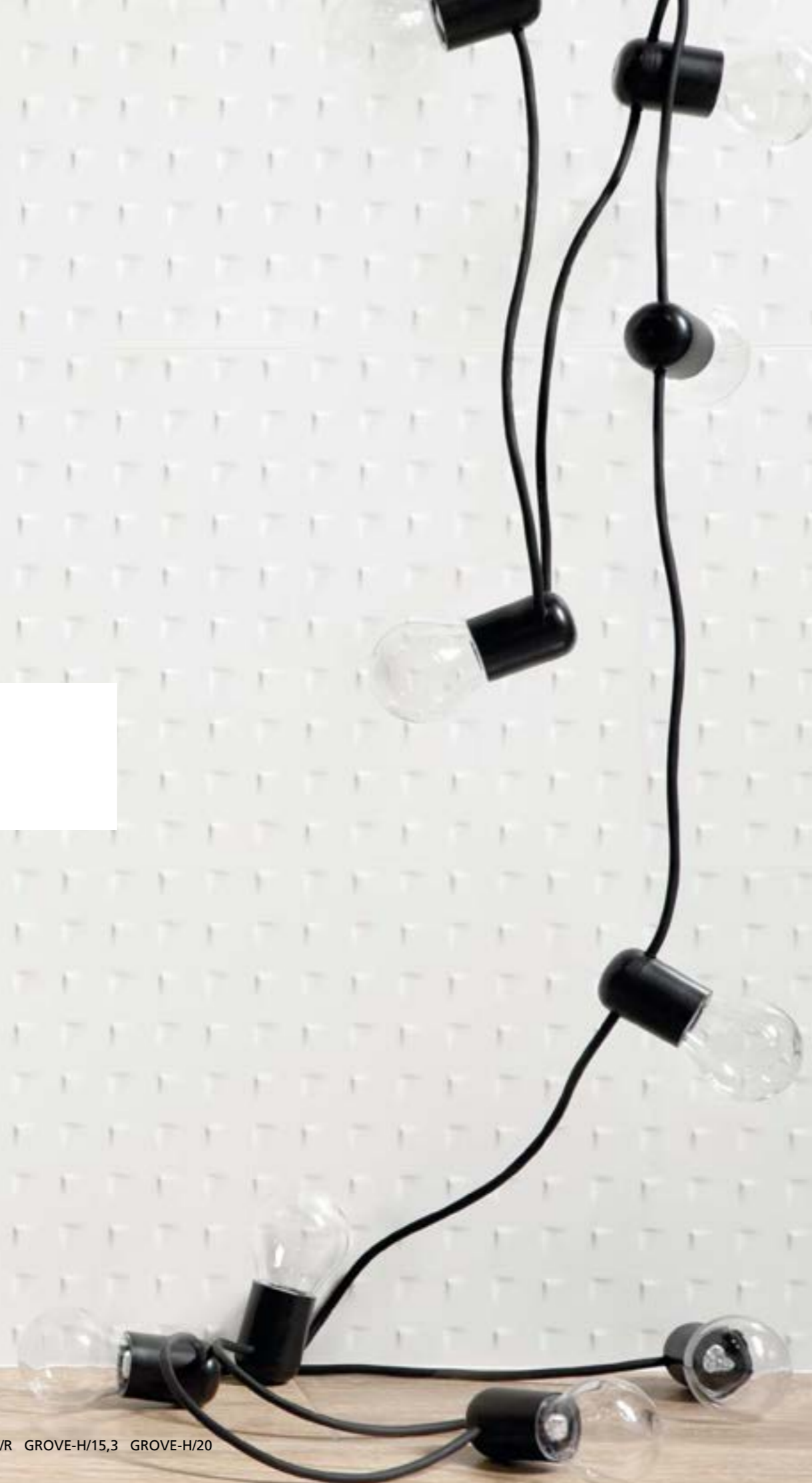
STUDDERED | STUDDERED-W/R GROVE-H/15,3 GROVE-H/20