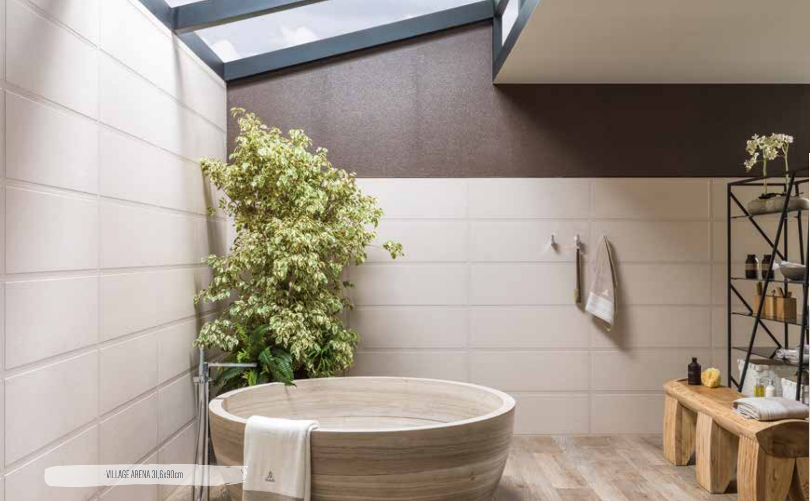
VILLAGE ARENA 31,6x90cm