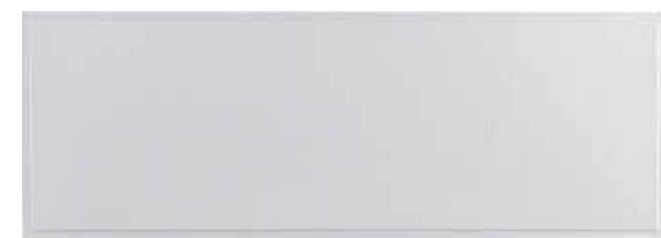
VILLAGE GRIS 31,6x90x1cm P3470794 / 100161083 G261 Butech recomienda junta / Butech recommends joint: Colorstuk Rapid n Gris B22502013 / 100004305