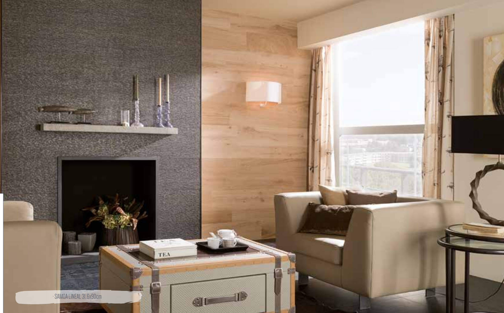
SAMOA LINEAL 31,6x90cm