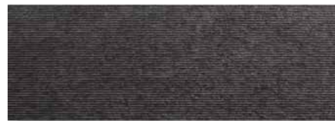
SAMOA LINEAL ANTRACITA 31,6x90x0,95cm P3470722 / 100145829 G271 Butech recomienda junta / Butech recommends joint: Colorstuk Rapid n Negro B22502006 / 100004299