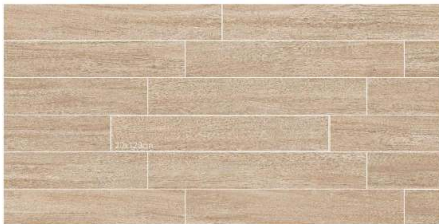
MAPPLE GTD01 20x120cm structured