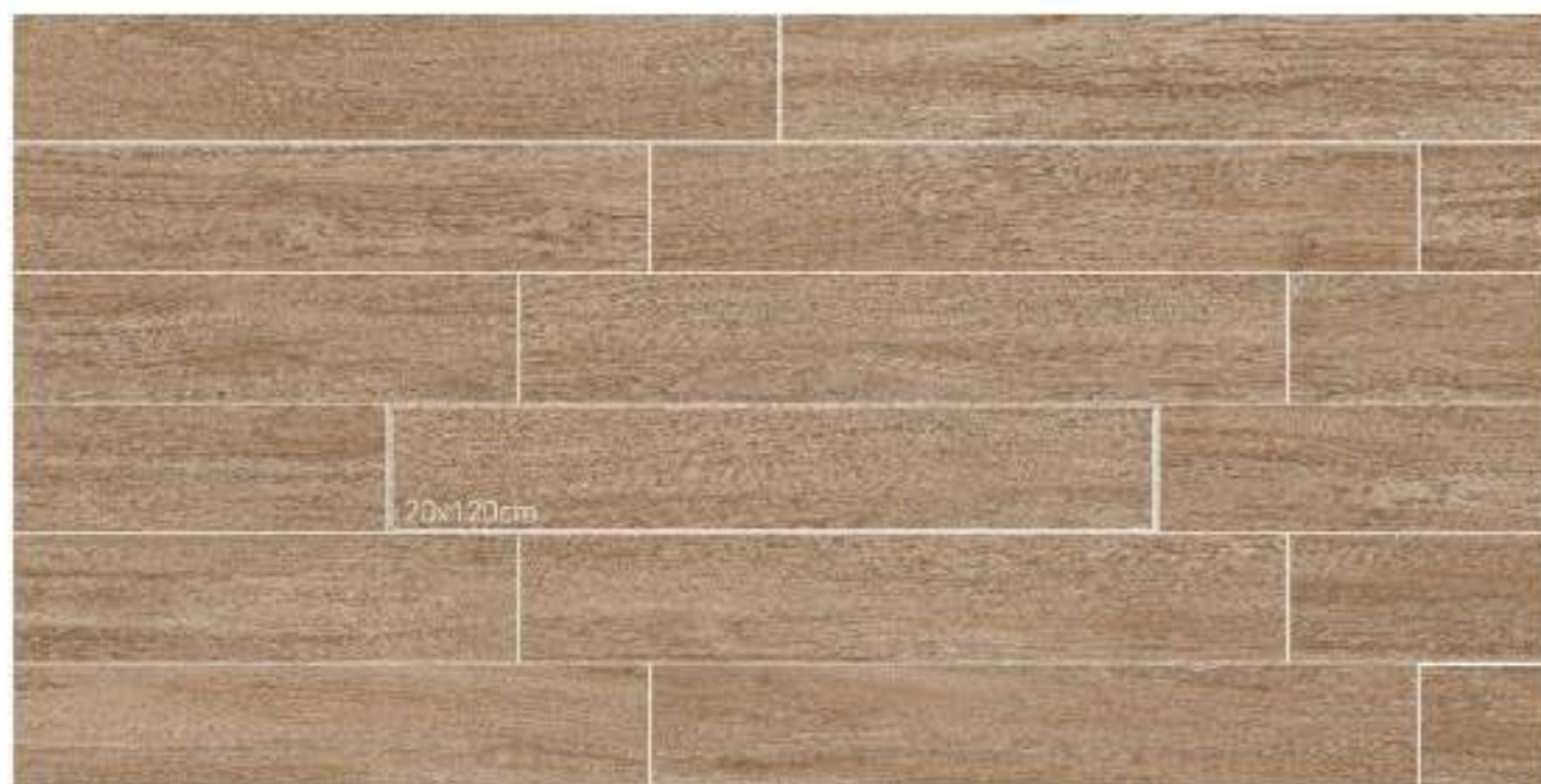
CHERRY GTD02 20x120cm structured