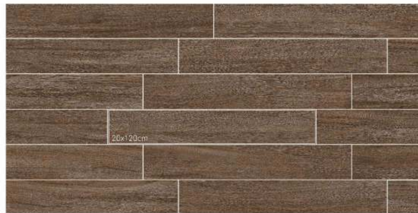
WALNUT GTD03 20x120cm structured