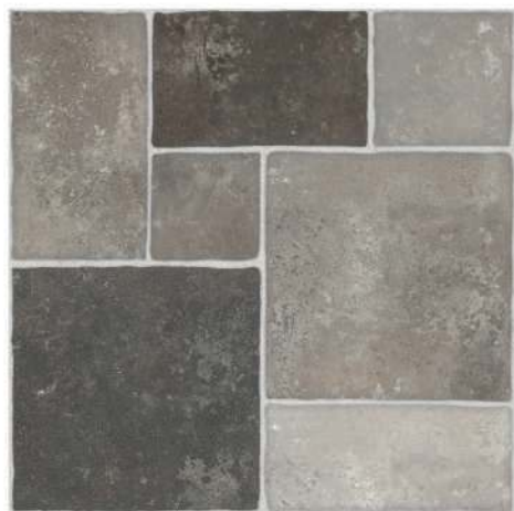
DK Urano Cement