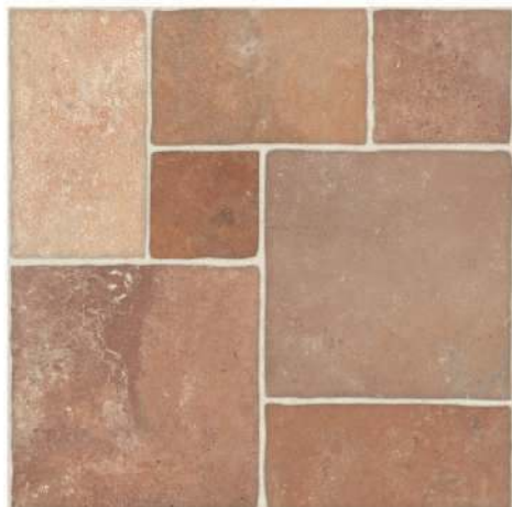
DK Urano Cotto