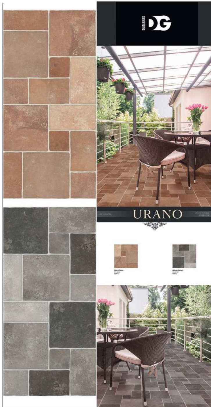
BEL17_002 · PANEL URANO