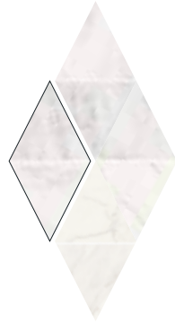
433819/ROMBO VERONA WHITE 150x295x8/ 2