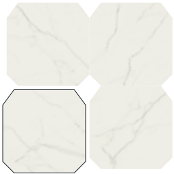
419751/OCTAGON VERONA WHITE 200x200x8/ 2

20X20-7,5X30-13,9X16 / 8"X8"-3"X12"-5"X6"