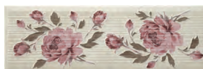
Dec. PRIMAVERA Perla 20x60 P87 5.677.37.822