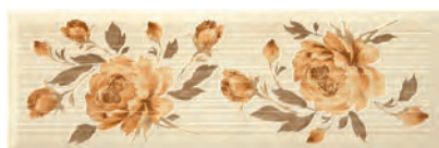
Dec. PRIMAVERA Marfil 20x60 P87 5.677.33.822