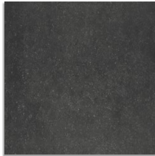
Loire-C Antracita G.153