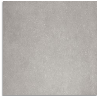
Loire-C Cemento G.153