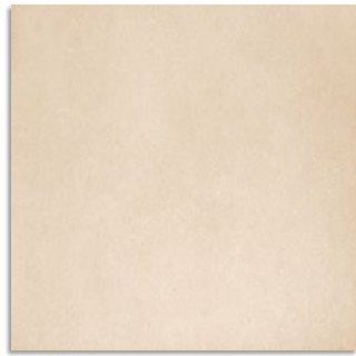
Loire-C Crema G.153