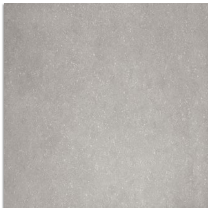
Loire-C Cemento G.155