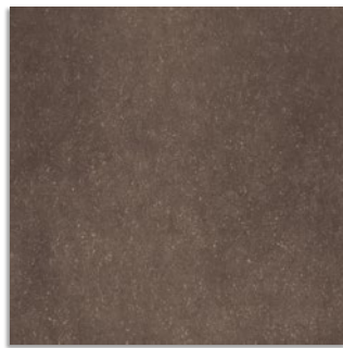
Loire-C Cacao G.153