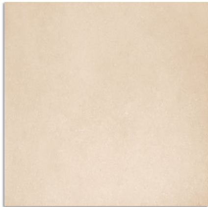
Loire-C Crema G.155