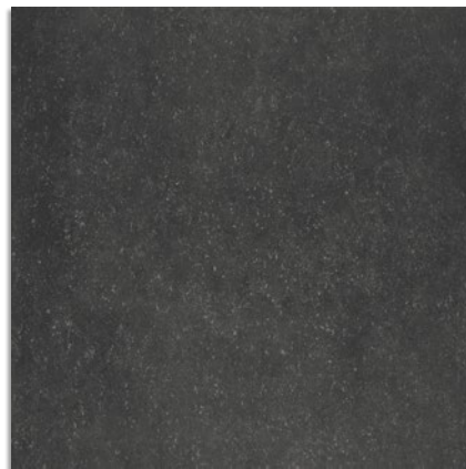
Loire-C Antracita G.155