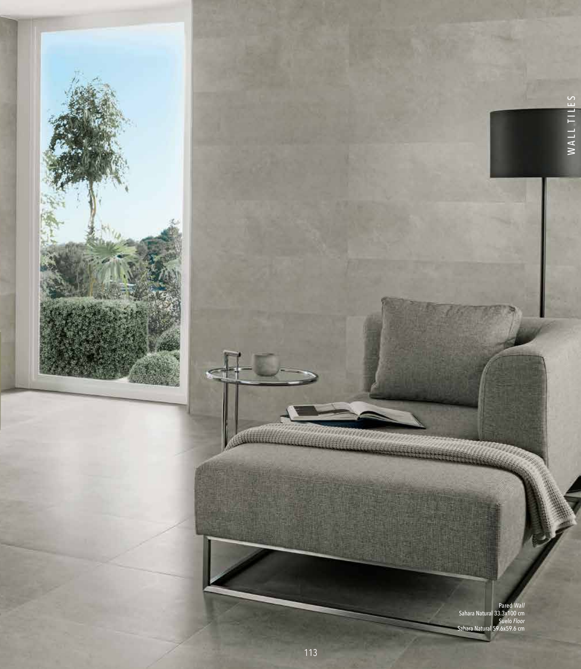
Pared Wall Sahara Natural 33.3x100 cm Suelo Floor Sahara Natural 59.6x59.6 cm