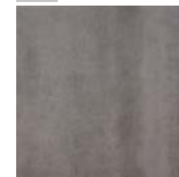
TRAFFIC-N/46 (45,6 x 45,6) D-4 MOHS 6 CLASE 1 R-9