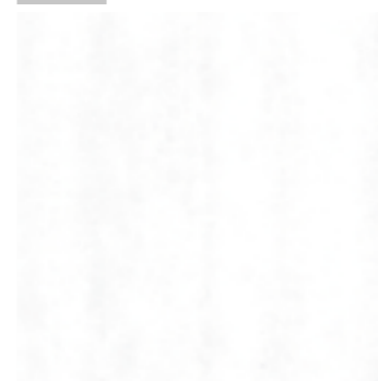
TRAFFIC-W/46 (45,6 x 45,6) D-4 PEI 4 MOHS 6 CLASE 1 R-9