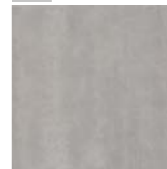
TRAFFIC-G/46 (45,6 x 45,6) D-4 PEI 4 MOHS 6 CLASE 1 R-9 TRAFFIC-G/A/46 D-4 PEI 4 MOHS 8 CLASE 3 R-11