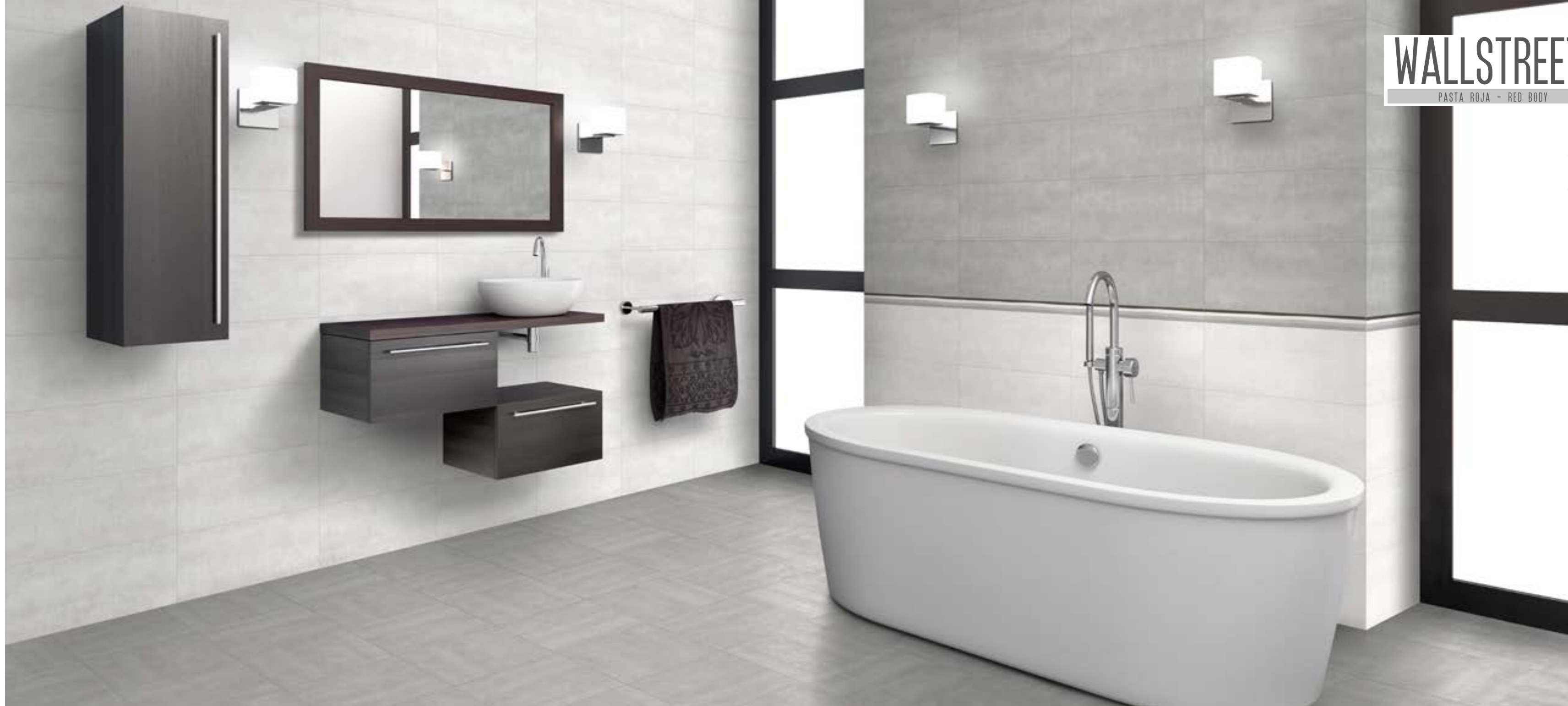
WALLSTREET WHITE WALLSTREET GREY C. WALL WHITE TRAFFIC-G/46