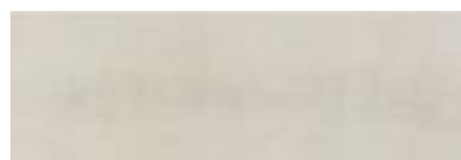
WALLSTREET BEIGE (20 x 60) D-9