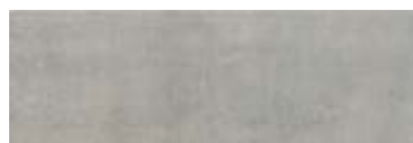
WALLSTREET GREY (20 x 60) D-9