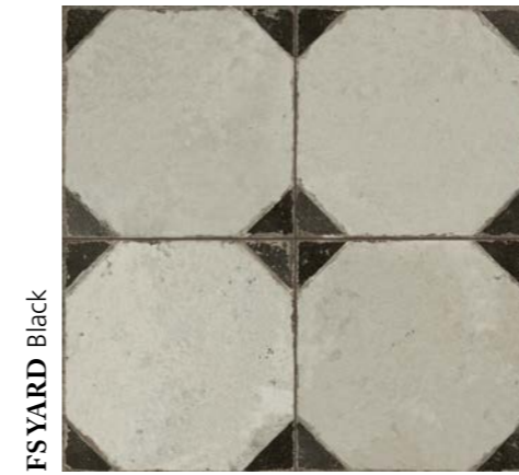
FS YARD Black