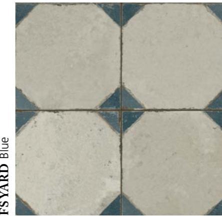
FS YARD Blue