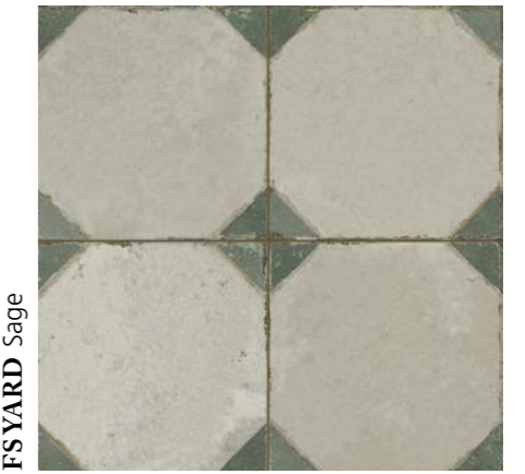
FS YARD Sage