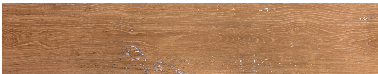
484956/YOSEMITE OAK METAL/150x900x8