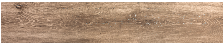
484955/YOSEMITE TAUPE METAL/150x900x8